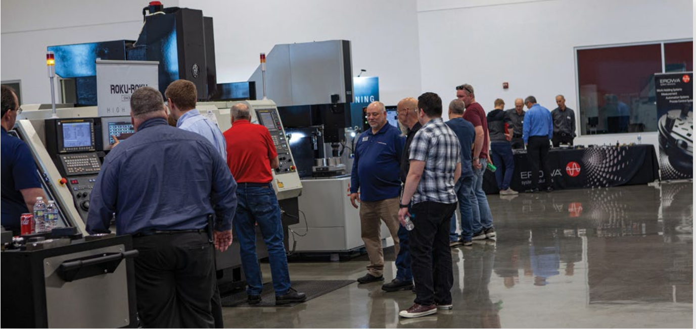
Machine Demonstrations in Progress

One of the topics of interest to many attendees was a need for automation. With the industry still experiencing an acute skilled labor shortage, many forward-thinking companies are looking to automation to maximize their productivity with a limited workforce.